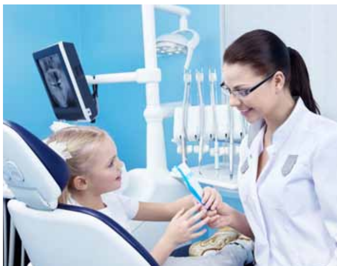
10 Sept - Study the importance of our role in treating kids

Mantra Erskine Beach Resort, Mountjoy Parade, Lorne. Registrations are available online at www.adavb.net ★ CPD points: 8