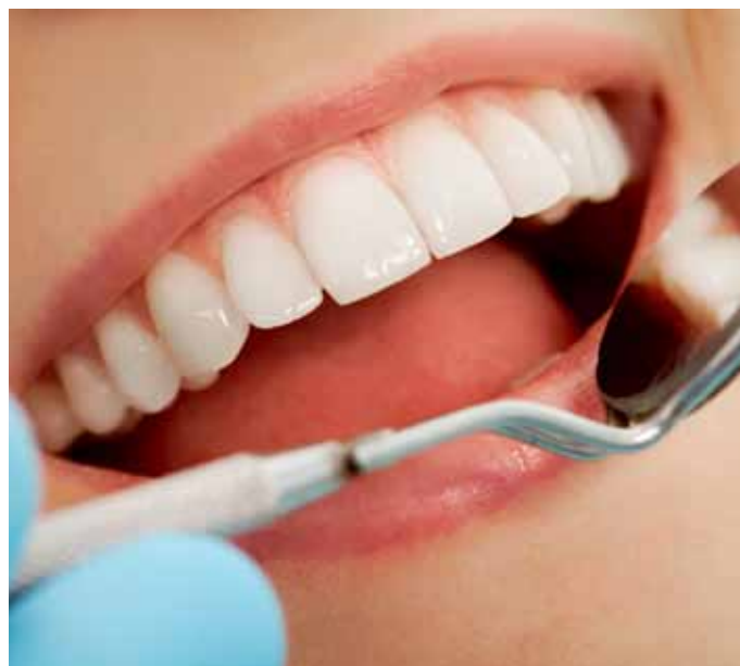
8 Oct - In house whitening for dental practitioners